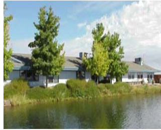
Administrative Offices at the Tanner Treatment Plant

The alternate water may also be obtained from an approved Point Of Entry (POE) water treatment system that is approved by the Amador Water Agency. The POE must be operated, maintained, and monitored by the Amador Water Agency, or the alternate water may be treated water purchased at the Amador Water Agency's Tanner Water Treatment Plant at Sutter Hill.