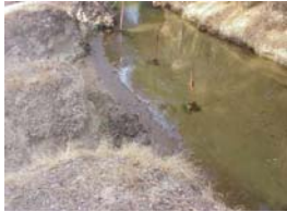
The Amador Canal.

The water provided through your service connection by the Amador Water Agency ( account numbers beginning with 01 , 08 or 10 ) is raw water that has received no treatment whatsoever. That means that it is not safe for domestic uses, including drinking, cooking, oral hygiene,