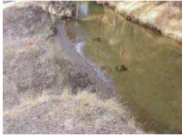
The Amador Canal.

The water provided through your service connection by the Amador Water Agency ( account numbers beginning with 01 , 08 or 10 ) is raw water that has received no treatment whatsoever. That means that it is not safe for domestic uses, including drinking, cooking, oral hygiene,