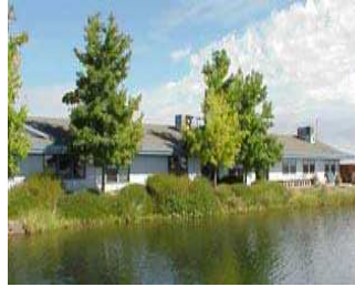
Administrative Offices at the Tanner Treatment Plant

The alternate water may also be obtained from an approved Point Of Entry (POE) water treatment system that is approved by the Amador Water Agency. The POE must be operated, maintained, and monitored by the Amador Water Agency, or the alternate water may be treated water purchased at the Amador Water Agency's Tanner Water Treatment Plant at Sutter Hill.